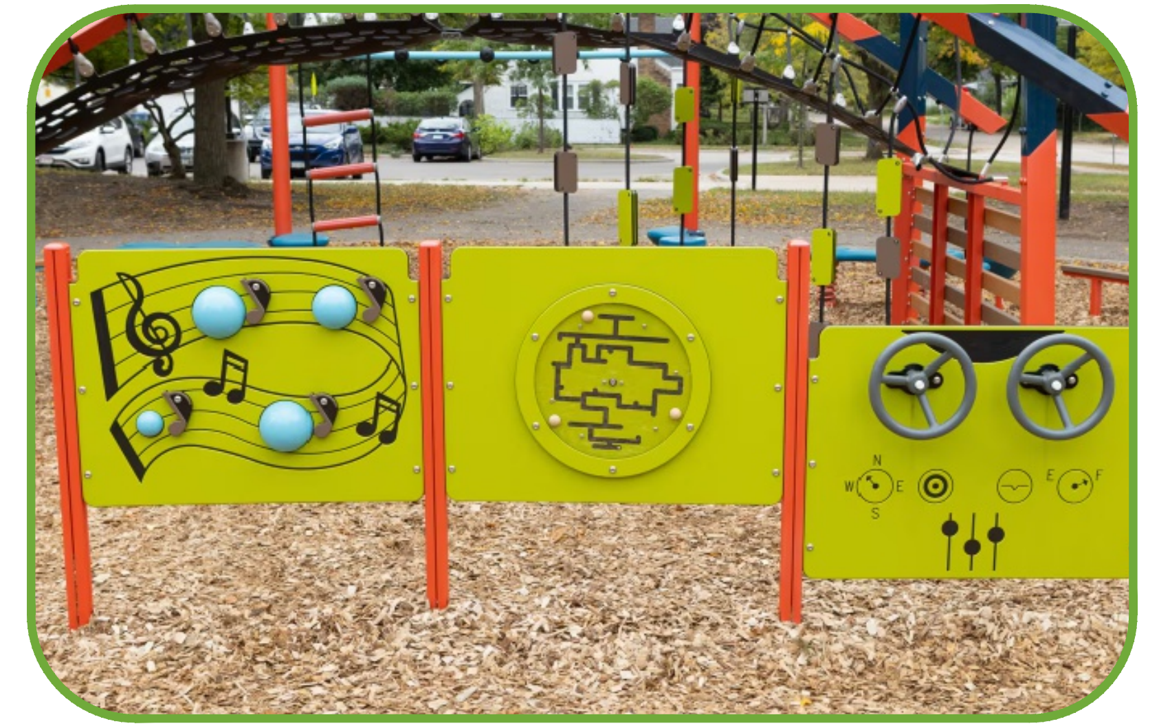
INTERACTIVE PANEL FEATURES