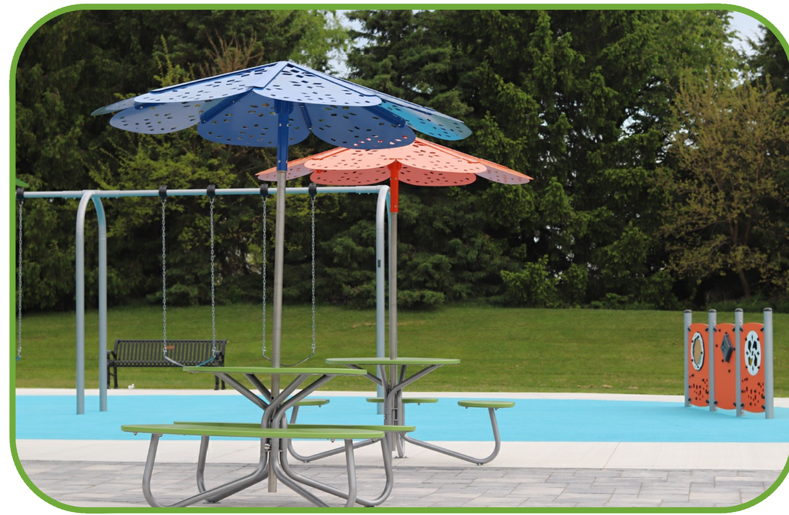
GATHERING TABLE WITH SHADE UMBRELLAS