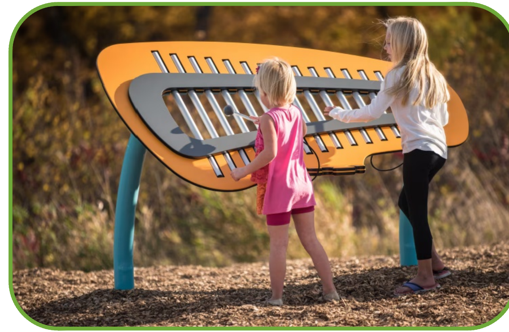
MUSICAL PLAYGROUND FEATURES